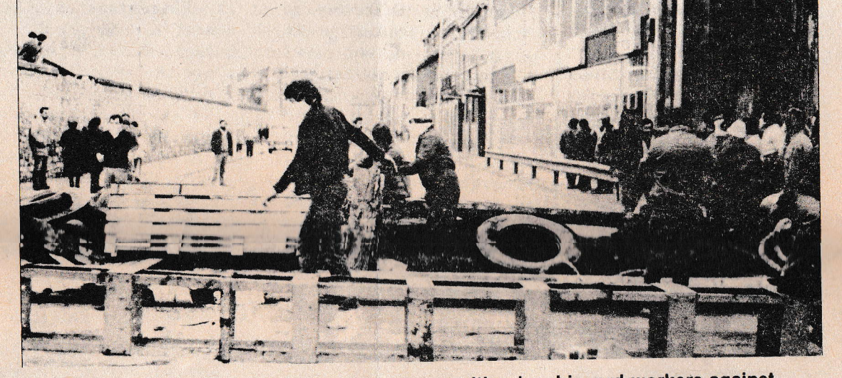
SPAIN 'Os Cangaceiros' record militant opposition by shipyard workers against redundancies in 1984/5. Amongst the most significant resistance was a college burned down in Oviedo, Asturias; the burning down of the control tower of a steel conveyor belt at the Ensidensa steel mill; the occupation of TV and radio stations the destruction of pro-government UGT offices in Vigo, Gallicia Province; the systematic destruction of buses until arrested strikers were released on demand, and the use of home-made weapons like bazookas For a copy of a longer article send a SAE. an act of resistance.